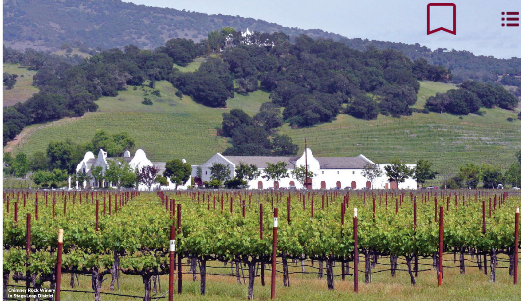
Chimney Rock Winery in Stags Leap District

Polished and stylish, embodying classic Cabernet Sauvignon character. Blackberry and black cherry notes dominate, with nuances of graphite, fine cedarwood and sandalwood spices. Medium- to full-bodied, it boasts satiny textures and velvety tannins that are firm yet well integrated, forming a solid foundation. The long finish is marked by cola spices, hints of violets and a subtle pop of vanilla bean aromatics. A refined and expressive wine with 19% Merlot in the blend. Drink 2025-2035 Alc 14.6%