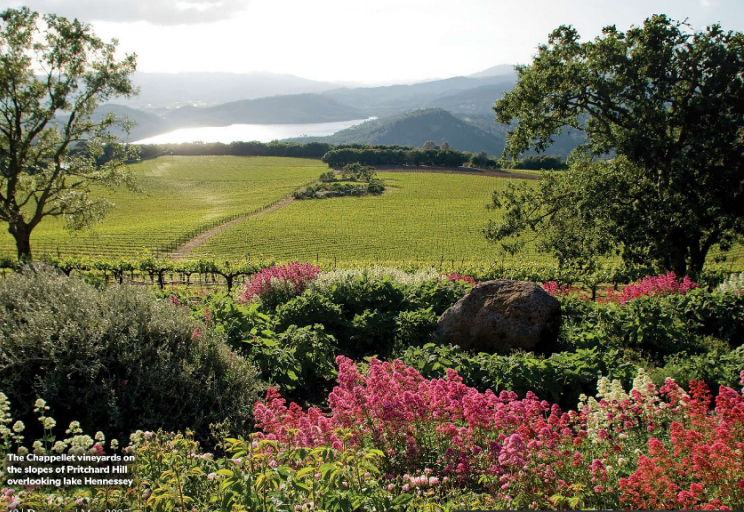
The Chappellet vineyards on the slopes of Pritchard Hill overlooking Lake Hennessy

POA FourCornersWine.com Unfolds with layers of savoury Oakville sagebrush, bay laurel and fresh tobacco. Expressive cocoa-powder tannins add texture, while a striking minerality that evokes crushed volcanic stones is intertwined with a saline edge. The acidity carries a bright, saline-mineral tension. This wine is charged with an electric energy, balanced tension and a wealth of expressive fruit, making it both extremely impressive and utterly inviting. Drink 2025-2045 Alc 14.2% ▶