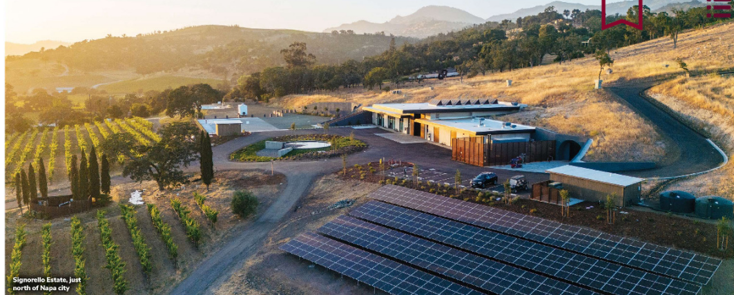
Signorello Estate, just north of Napa city